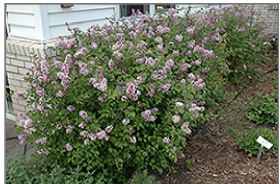
Prince Charming Lilac in bloom