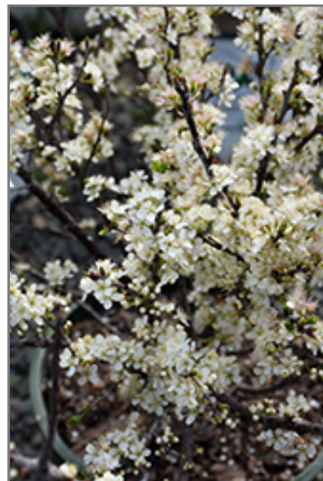
Beach Plum flowers

Beach Plum is recommended for the following landscape applications;