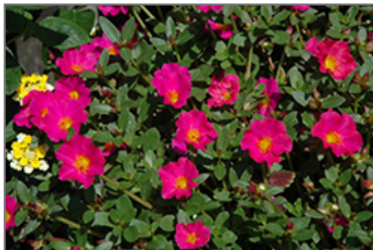
Mojave Fuchsia Portulaca flowers

Mojave Fuchsia Portulaca is recommended for the following landscape applications;