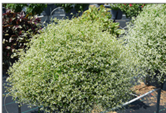
Glitz Euphorbia in bloom