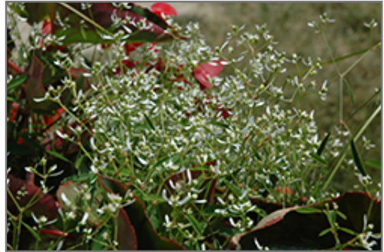
Glitz Euphorbia flowers

Glitz Euphorbia will grow to be about 12 inches tall at maturity, with a spread of 18 inches. When grown in masses or used as a bedding plant, individual plants should be spaced approximately 14 inches apart. Its foliage tends to remain dense right to the ground, not requiring facer plants in front. This fast-growing annual will normally live for one full growing season, needing replacement the following year.