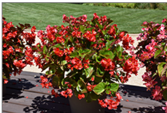
Whopper Red Green Leaf Begonia flowers