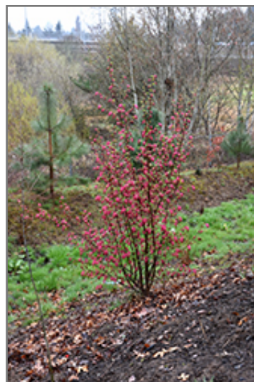
King Edward VII Winter Currant in bloom