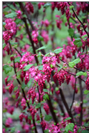
King Edward VII Winter Currant flowers