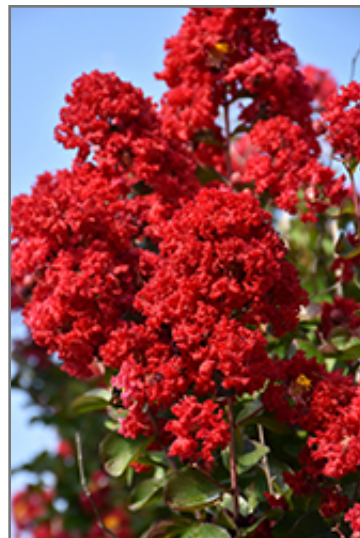
Dynamite Crapemyrtle flowers