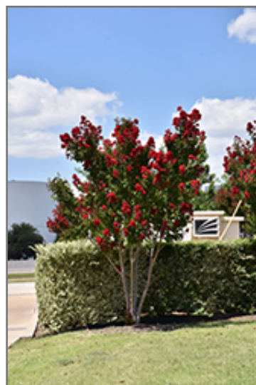
Dynamite Crapemyrtle in bloom